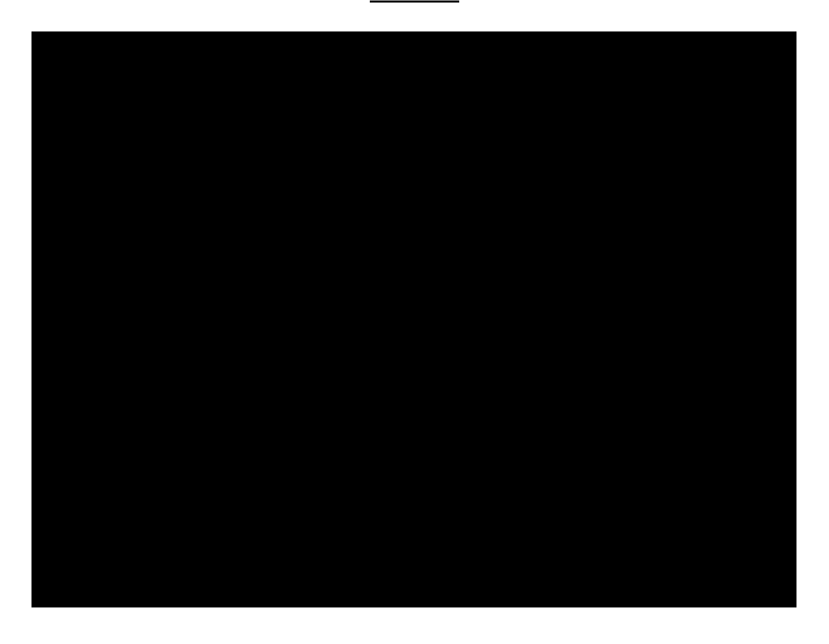
EXHIBIT 4 ANALYSIS OF EXISTING RENEWABLE REC BIDS \underline{\text{BID STACK}}

Attachment 1 National Grid: Page 6 of 7 Docket No. 4149 Docket No. 4227