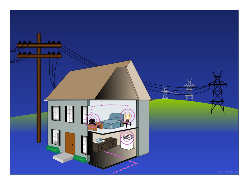
Figure 1. Numerous sources of ELF EMF in our homes (appliances, wiring, currents running on water pipes, and nearby distribution and transmission lines).