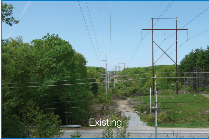
Providence Pike, North Smithfield - Facing West